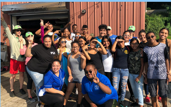
Field Learning! Participants in FYI's Amistad Dual Language School program visited Hudson River Sailing to learn practical applications to STEM questions.