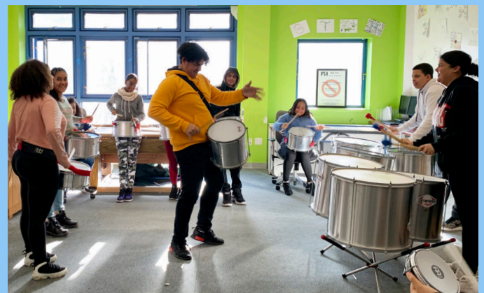
Practice makes perfect! FYI's Samba Corps won first place in a city-wide performance competition. Our new Musical Arts Department will bring the joy of music to all of our program sites in 2020.